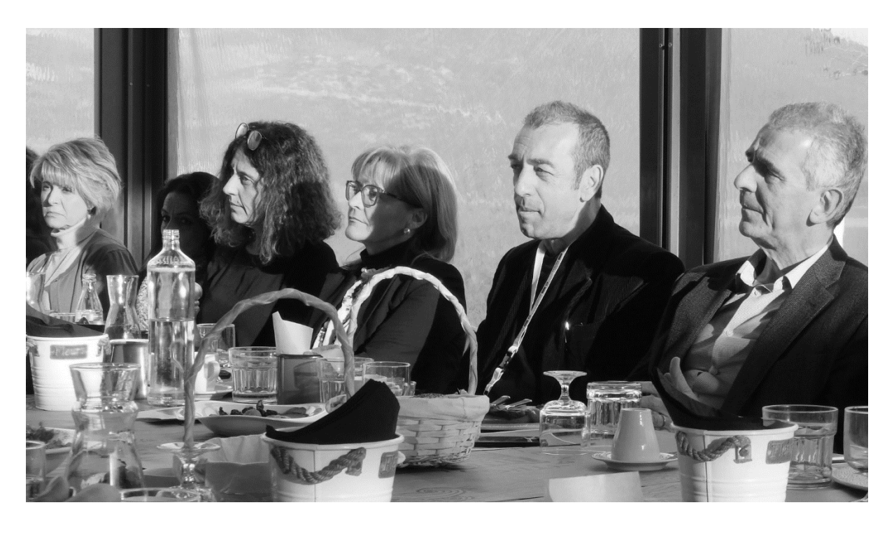
Project co-funded by European Union, European Regional Development Fund (E.R.D.F.) and by National Funds of Greece and Italy